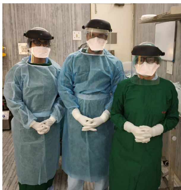
Figure 1: "Be Aware be Safe" The use of Personal Protective Equipment while performing caesarean section of suspected COVID- 19 patient in operative room of our tertiary care hospital.

.in view of above findings broad spectrum antibiotic and antipyretic was given parenterally. On pulmonologist opinion, chest Xray was done which was normal. Nasopharyngeal swab was sent for RT-PCR (Reverse transcriptase polymerase chain reaction) test. After one-hour patient was afebrile and was shifted for emergency caesarean section in view of PROM with FGR with uteroplacental insufficiency. Under spinal anaesthesia, Caesarean section was done by taking all precaution and wearing Personal Protective Equipment (PPE). A male baby was delivered by vertex presentation at 1:27am of weight 2.5 kg with APGAR score 8/10,9/10. Baby was immediately shifted to NICU for COVID-19 evaluation. Placenta was sent for Histopathological examination. Post operatively patient was kept in isolation ward. Patient did not have any fever and cough subsided in 24 hours postoperatively. The COVID-19 test report came 12 hours later as it was sent to a government institute in next district at that time. The report was negative for both mother and baby. Patient was managed in isolation ward and postoperative period was uneventful. The patient was kept under observation and isolation for 14 days. Counselling for pros and cons of breastfeeding was done and patient was opted for exclusive breast feeding. Patient was healthy and asymptomatic and was discharged home with a healthy baby on 15 th post-operative day.