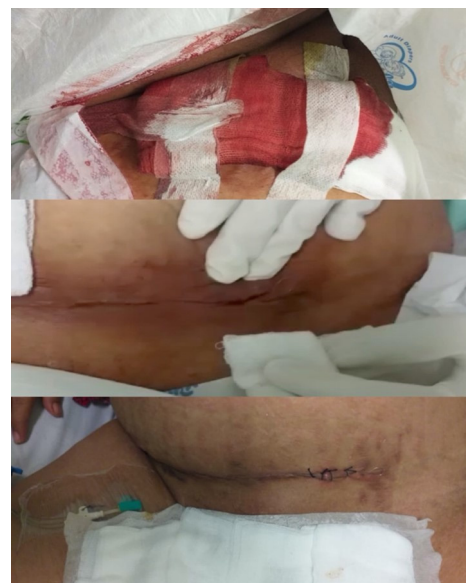
Figure 3 Surgical wound bleeding was caused as an adverse effect of heparin therapy. The gauze was soaked in blood on day 11 of admission (D11) (top). The source of bleeding from the wound incision detected on D11 is seen here (middle). The incision was resutured, and the bleeding stopped after cessation of heparin therapy on day 15 (bottom).

changed to levofloxacin 750 mg once a day and ciprofloxacin 200 mg once a day. The patient's condition improved during the next several days. On D24, the patient had stable vital signs: normal BP (126/73 mm Hg) and good saturation with \text{O}_2 from nasal prongs (95%–96%), and the incisional wound had healed. The patient was discharged on the next day (D25). The timeline of this case is shown in figure 4.