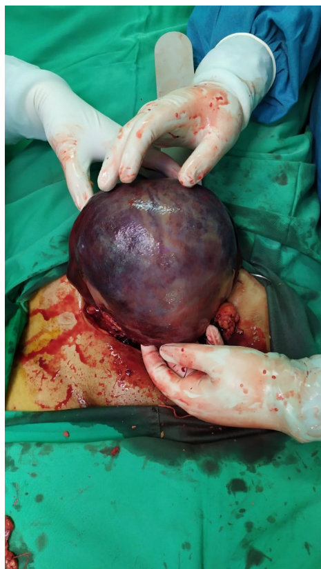
dl). An ultrasound scan of the abdomen revealed significant free fluid, leading to the diagnosis of internal bleeding. Therefore, an exploratory laparotomy was performed. The uterus was found to be enlarged, atonic and resembled a Couvelaire uterus (figure 1). A Couvelaire uterus is a purplish-blue uterus caused by uterine bleeding that penetrates the myometrium. A haematoma was found in the left adnexa, which was considered the source of intrauterine bleeding. Initially, we tried to perform modified B-lynch procedure, but it was unsuccessful; therefore, we decided to perform a supracervical hysterectomy. We chose not to perform total hysterectomy in this case because the source of bleeding was in the uterine corpus. The cervix was maintained to partially preserve sexual function. The total blood loss during the surgery was 1200 mL with a fluid input of 2300 mL. The patient received a total of 3 units of whole blood (WB) transfusion before surgery and 2 units of WB during surgery.

The patient was then treated in the ICU using the ventilator mode pressure-synchronised intermittent mandatory ventilation (PSIMV), positive end expiratory pressure of 6 cm of water, and a fraction of inspired oxygen of 100%, with a global coma scale (GCS) of E4Vxm6, and oxygen saturation of 97%–100%. The ventilator support was continued after surgery to maintain adequate oxygen delivery, as the patient had severe anaemia which limited oxygen delivery to the tissues. Another consideration was the risk of transfusion-related acute lung injury, which can occur as a result of massive transfusion. On laboratory examination, we found anaemia, hypoalbuminaemia, thrombocytopenia, hyponatraemia and hypokalaemia (table 1). The patient was administered non-steroidal anti-inflammatory drugs, ceftriaxone and albumin and underwent packed red cell